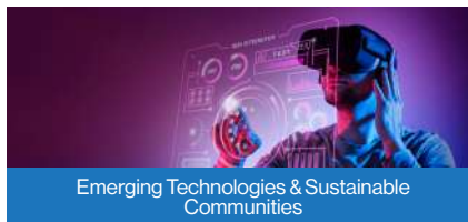
Emerging Technologies & Sustainable Communities