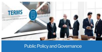
Public Policy and Governance