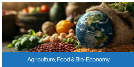
Agriculture, Food & Bio-Economy