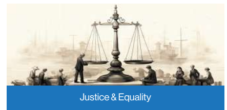
Justice & Equality