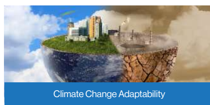
Climate Change Adaptability