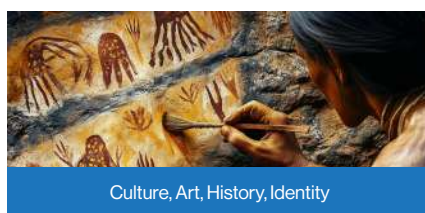
Culture, Art, History, Identity